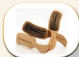
NANOKERATIN HAIR ECO COMB