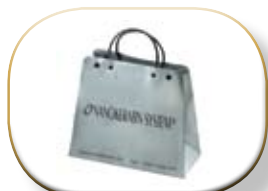
NANOKERATIN GIFT BAG