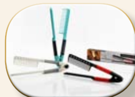
NANOKERATIN EASY COMB