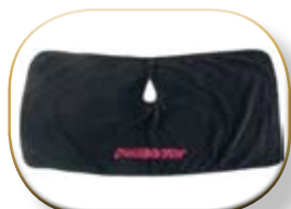
NANOKERATIN HAIR TOWEL