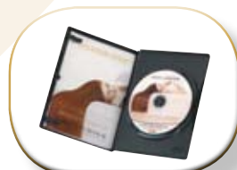
NANOKERATIN DVD NANOKERATIN SYSTEM