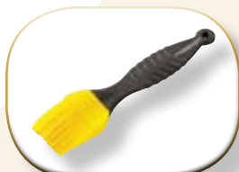
NANOKERATIN SILICON BRUSH