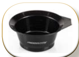
NANOKERATIN HAIR BOWL