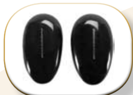
NANOKERATIN EAR PROTECTOR